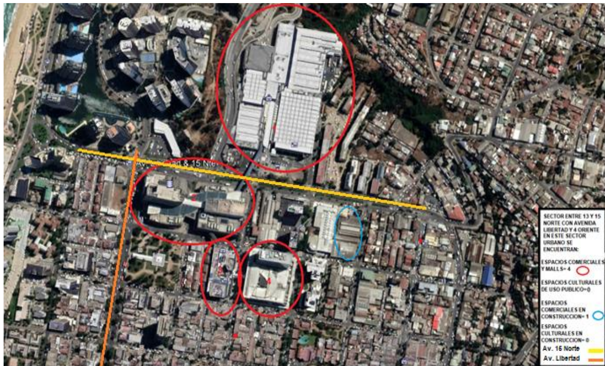
Figure 1. Aerial view of the central urban area of the city of Viña del Mar.

activities in this commercial urban radius, around Avenida 15 Norte with Avenida Libertad.